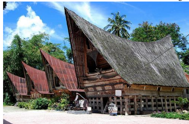
Fig. 2. Rumah adat: Batak Toba Houses, Lake Toba, Indonesia. The