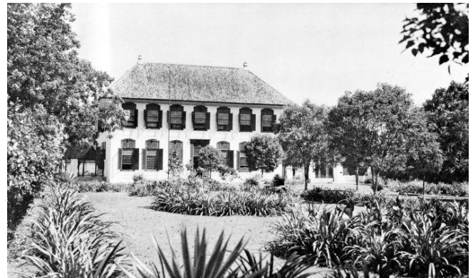
Fig. 5 National Archives Museum around 1760, Jakarta. The picture shows the old residential house built in Colonial Sil, the private residence of Governor. General Reinier de Klerk, which is now used as the National Archives Museum.

It can be seen that the adoption of the western architectural style is initially an advantage that offers Indonesians other ways of protecting themselves from the sun and animals, among other things. Over the years, however, it has become apparent that the locals have not without reason developed certain building styles to withstand precisely the conditions that the weather brings with it, and these findings have increasingly changed the elaboration of the Western style. The buildings, which were kept closed for the time being, were adapted to the climate and opened and thus better ventilated. Even today it can still be seen that the construction of houses made of stone and concrete works, but not well. Many houses show large mold problems, which are promoted by the high air humidity in to closed areas. The lessons learnt from traditional architecture are thus introduced but not always sufficiently implemented.