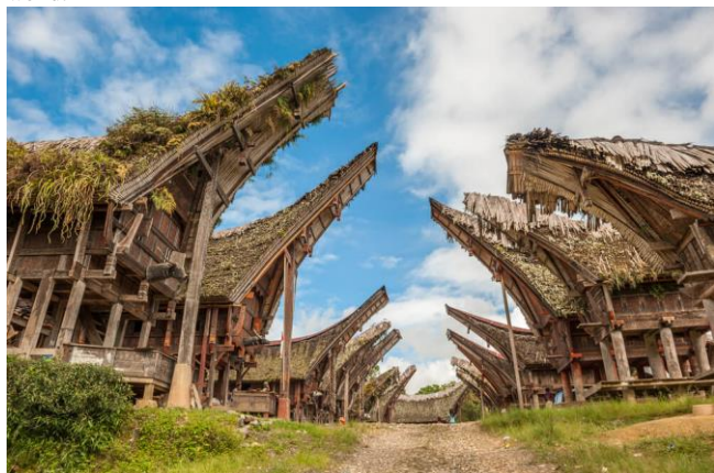
Fig. 3. Rumah adat: Tana Toraja. Another representation of a traditional village in the style of the Rumah adats also shows the very special roof shape and the construction with stilts. https://www.seva.id/blog/tradisi-pemakaman-harga-sultan-ala-tana-toraja-102019/

picture shows a row of the typical Rumah adat houses, their roof form sets itself off optically from the roofs built today in western regions of the world.