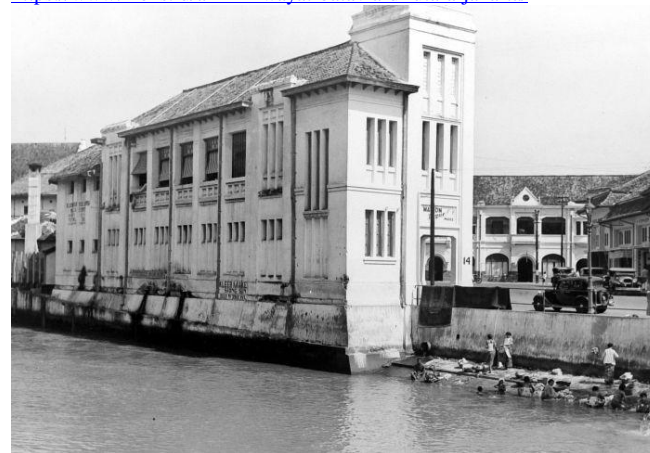
Fig 5. Pasar Baru, Postweg, a colonial building on one of the canals of the old town of Bavaria, which was later renamed Jakarta

https://www.ikons.id/akhir-riwayat-batavia-di-utara-jakarta/